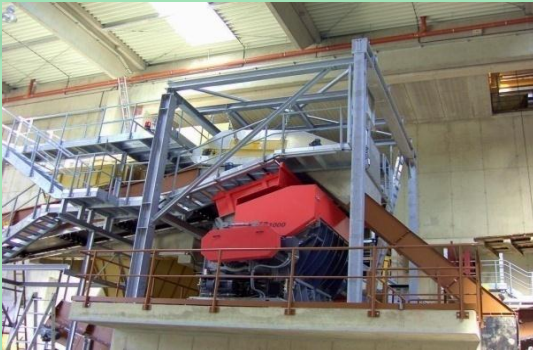
Conveying technology since 1932