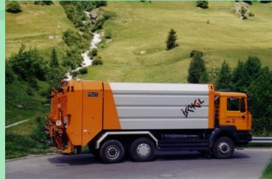
Municipal vehicles since 1955