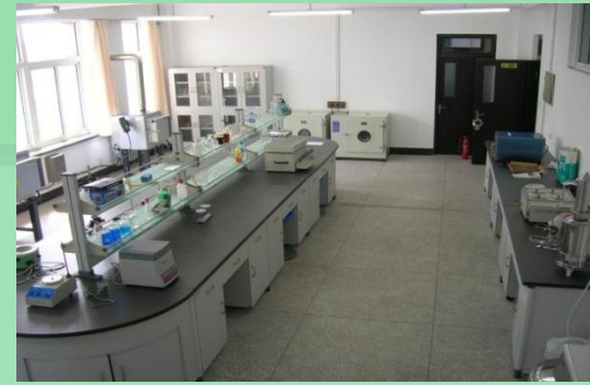
Education/Training since 2003