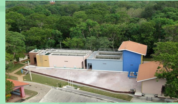
Environm. technology since 1972