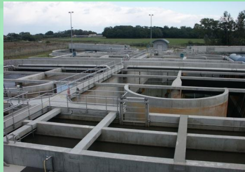
Water/Sewerage since 1988